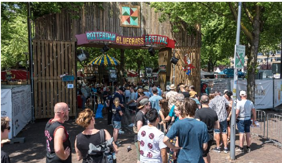
November 22, 2023

EBMA labelled actions can and should start in the field; EBMA may incite but does not necessarily initiate actions.